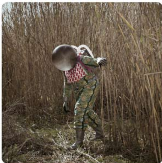
Cristina de Middel , The Afromauts (2012)

Art Base Africa, a new online platform for contemporary African art, launches during LagosPhoto 2013 with a special dedicated issue of the festival. Art Base Africa includes a database of contemporary African artists, an online journal that is published in quarterly thematic issues, and an online radio broadcast. Art Base Africa is supported by the Prince Claus Fund for Culture and Development.