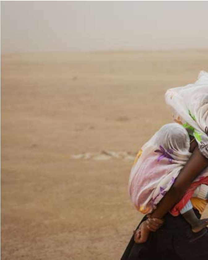
Timbuktu Crossing (2013)