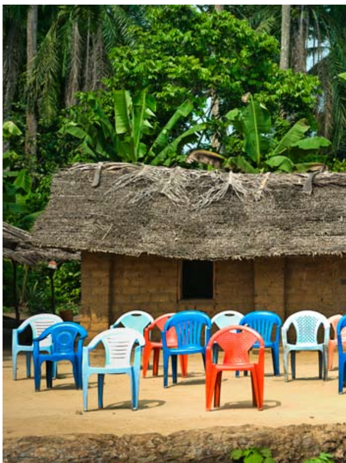
Patrick Willocq , On the road from Bikoro to Bokonda , 2012